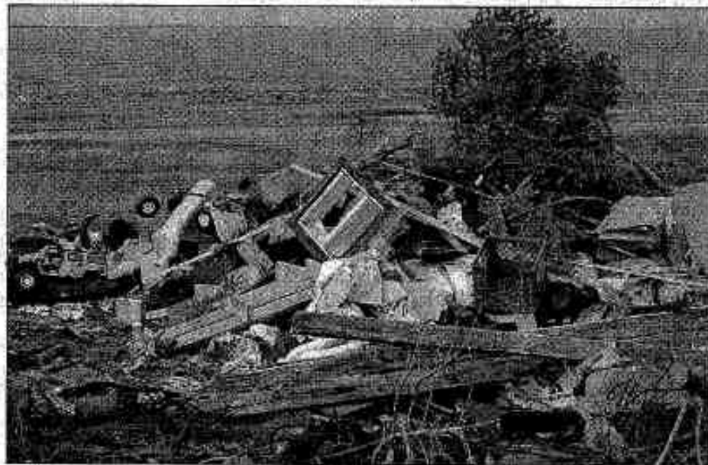
An illegal dump site in the Lower Cove area.

Anyone with information regarding illegal dumping can contact Crime Stoppers at 1-800-222-8477.